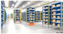
Lift & Materials Handling