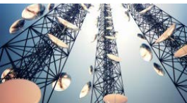
Broadband Wireless Access