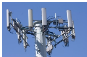
Broadband Wireless Access