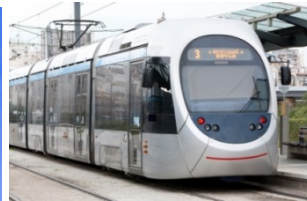
MRT / Railway