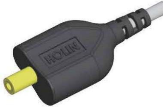
Custom connector design and mass production