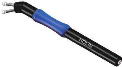
Metal part insert-molding

In addition to the production of typical molded-cable assemblies, we also offer Custom Molding services, such as PCB waterproof molding, Sensor waterproof molding, Custom molding, Metal parts with Plastic injection molding, CNC Turned Parts & Pressed Metal Parts.