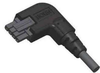
Connector or component structure enhancement