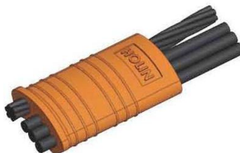
Custom mechanical part molding