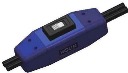
Electronic component overmolding