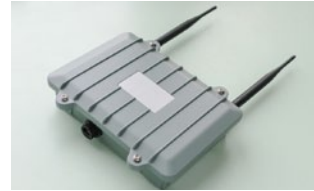
Outdoor AP / CPE + Data Collector