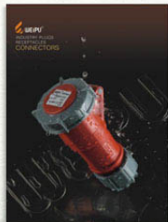
CEE Industrial connectors