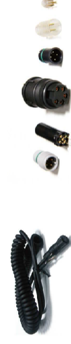
Customized Cabling Solutions