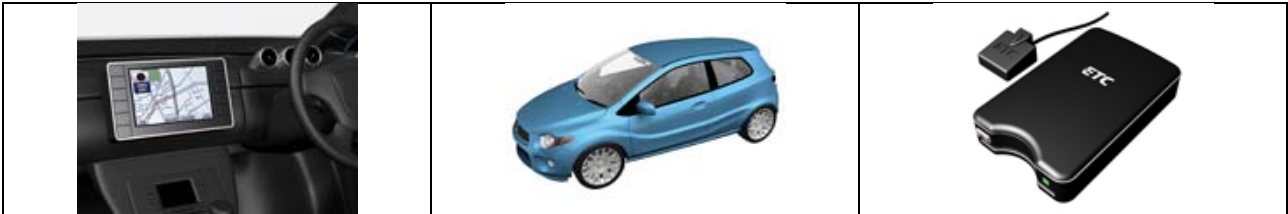
Car Navigation System