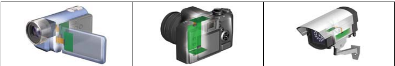
Digital Video Camera