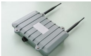
Outdoor AP / CPE + Data Collector