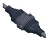
BMC Series Power Connector (For Trunk Cable)