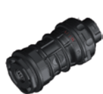
PWII Series Power Connector (For Trunk Cable)